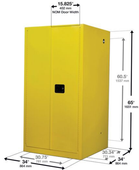
Interior Dimensions Exterior Dimensions